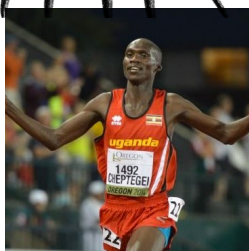
Joshua Cheptegei Olympic Gold Medalist

Queen of Buganda and empowerment activist for women & youth