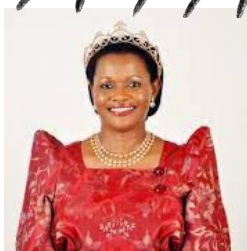
HRH Nnabagereka Sylvia Naginda

Queen of Buganda and empowerment activist for women & youth