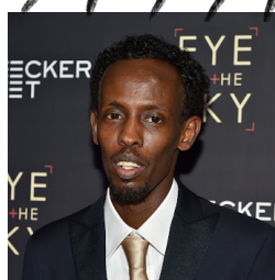
Barkhad Abdi Actor and Director