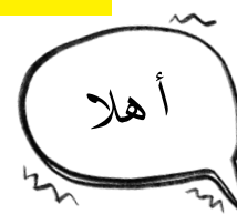
Arabic (pronounced 'ahlan')