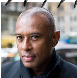
Caryl Phillips Author