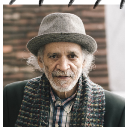
John Agard Playwright, poet and children's writer