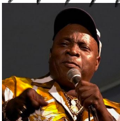
Mighty Sparrow Soca Artist