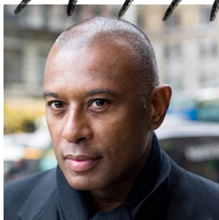
Carlos Brathwaite Professional Cricketer